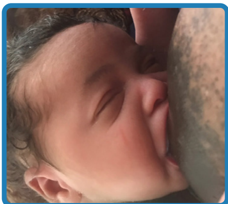
Good latch with wide mouth